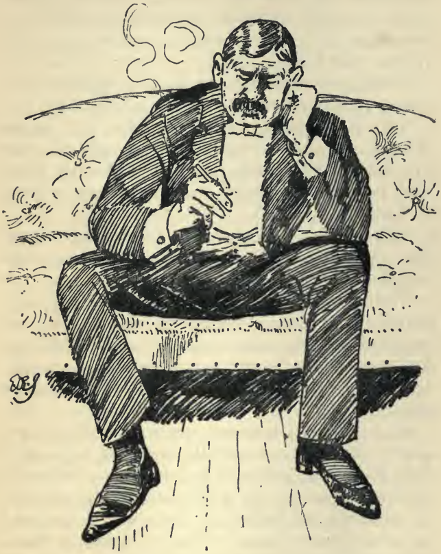
MR. FLOOD'S THUNDERCLOUD PRESENCE

to a conclusion. "I had a bet with Flurry Knox